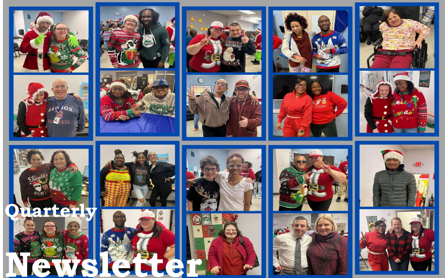
Holidays Around the World-See pg. 2